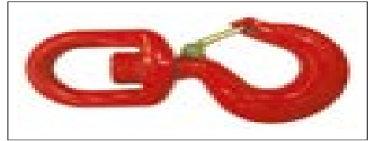
Safety: homologated self locking swivel hook